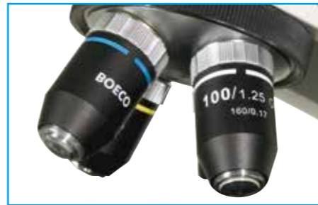
SEMI-PLAN ACHROMAT OBJECTIVES