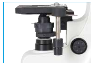
RIGHT HAND CONTROL STAGE