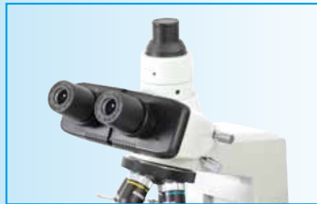
TRINOCULAR MODEL BM-180/T/SP