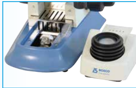
EASY REPLACE OF LAMP