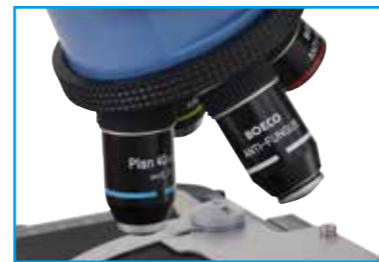
ANTI FUNGUS TREATED OBJECTIVES