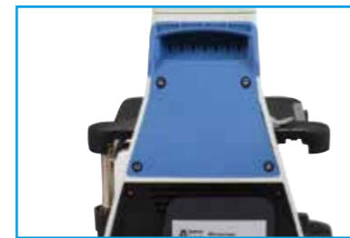
BACK HANDLE / POWER CORD WRAP

Optical Head: Seidentopf Binocular Head, 30° inclined, 360° rotatable, with high quality infinite optical system Nosepiece: Backward quadruple revolving nosepiece Eyepiece: Pair Eyepiece WF 10X /20 mm, diopter adjustable, with anti fungus treatment, Interpupillary Distance 47-75 mm Objectives: BOECO Anti Fungus Infinite Plan Achromat Objectives 4x, 10x, 40x (S), 100x (S) (Oil) Stage: Double layer mechanical specimen stage. 216 x 150 mm Travel area 78 x 54 mm, Right hand stage handle Focusing: Low position, coaxial coarse and calibrated fine focus control, with graduation reading 2 microns per division. Total focusing range 20 mm, Safety autofocus stop unit. Condenser: Sliding-in centerable Bright field condenser, n.A. 1,25, Integrated Iris diaphragm and filter tray. Illumination: S LED lamp, light intensity adjustable. Body /power: Sturdy body with supportive rubber and inbuilt power supply 100 - 240V Supplied with: Dust cover, green filter, immersion oil and instruction manual Dimension: 230 x 376 x 406 mm Weight: Netweight 8 kgs, Grossweight 9 kg Packing: styrofoam shelf in a cardboard box