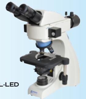
BM-700 WITH FL-LED