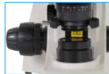
COLLECTOR AND CONDENSER