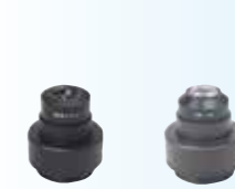
DARK FIELD CONDENSER DRY AND OIL