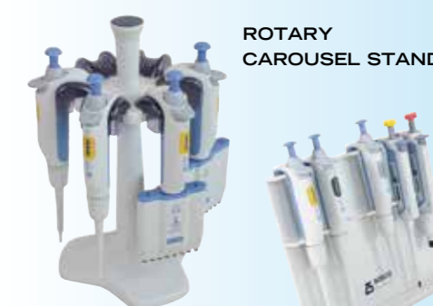
ROTARY CAROUSEL STAND